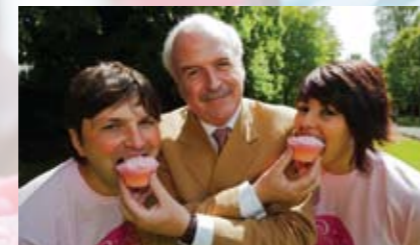
Marty Whelan at the Cupcake Campaign launch