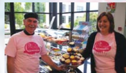
Food Services Team join the campaign