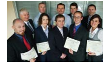
The ARAMARK Energy Team

Nine ARAMARK Ireland employees recently qualified as a Certified Energy Manager (CEM). The designation CEM recognises individuals who have demonstrated high levels of experience, competence, proficiency, and ethical fitness in the energy management profession. The ARAMARK energy team now joins an elite group of 10,000 professionals serving in the industry around the world.