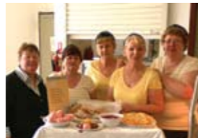
Food Services Team

Food service units from across the country participated in this year's annual Odlums National Pancake Party in aid of the National Children's hospital raising over €3,000 in much needed funds for the hospital. ARAMARK has been an exclusive catering partner for the event since 2008.